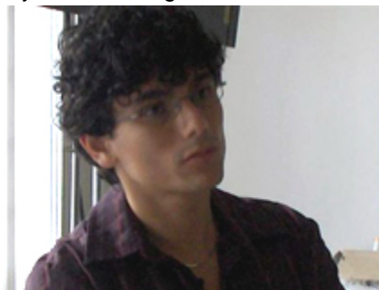
On set of film "Together"

My father, the greatest man alive, was able to get American Residency on account of his hard work as an esteem professor. He came to Canada/America with hopes of opening doors for his family and children. After a couple of years in Canada (which were hard and difficult) he left for the USA where he now works constantly and gets to travel. Again, the USA opened doors for him like it is now opening for me. I have never met someone that works harder than my father (but we all say that about our parents). I thank my father for his brevity, passion, love and understanding.